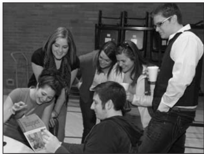
Seniors looking over The Carmel Rapper