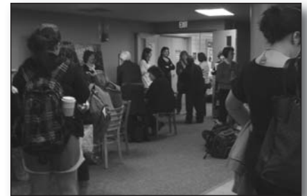
Students, faculty and staff waiting for the “all clear” during the recent tornado warning