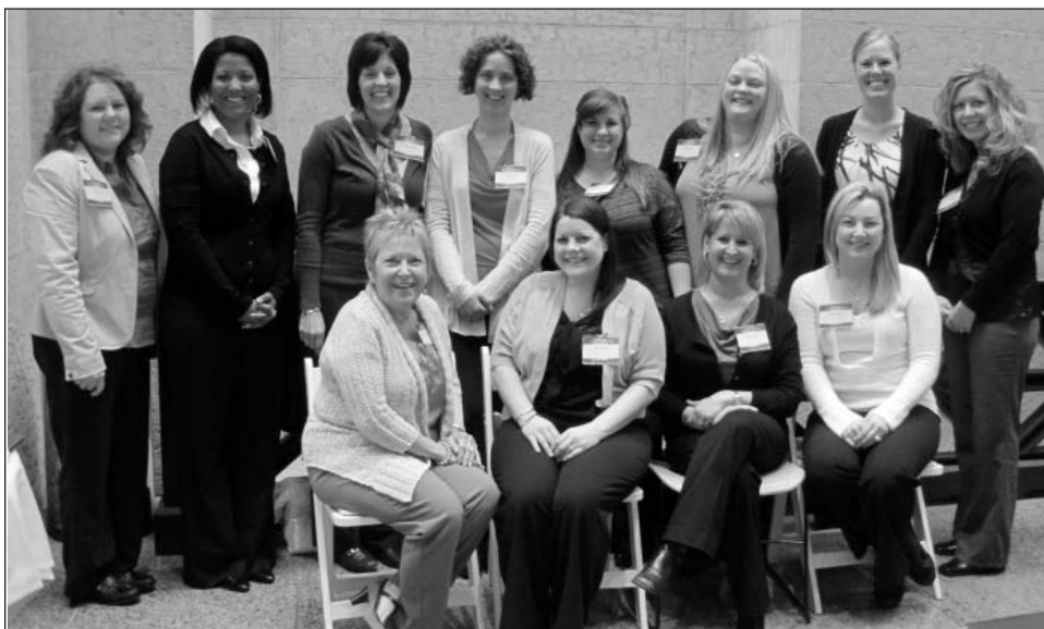
Students enrolled in the Master of Science Program learn about the legislative process related to the scope of practice for Advanced Practice Nurses