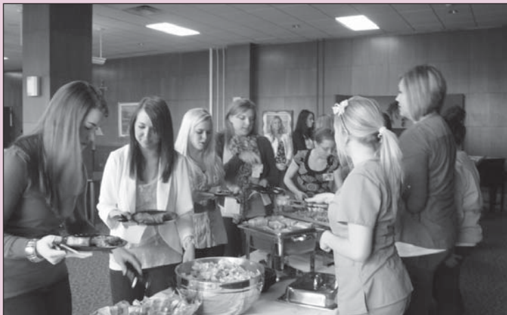
Seniors counting down the days to graduation!