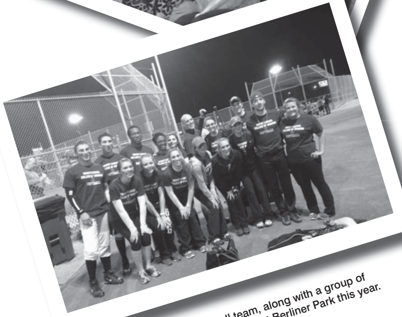
The MCCN Nightingales softball team, along with a group of friends and fans, enjoyed games over at Berliner Park this year.