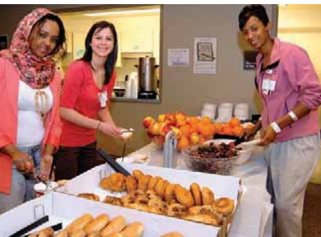
Students taking a welcome break at the alumni-sponsored free finals breakfast.

Three senior students who received Alumni Association scholarships spoke. Mount Carmel student ambassadors assisted at the event and had the opportunity to chat with alumni, which everyone enjoyed.